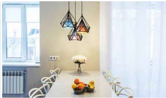
LED Performer Tunable Colour Bulb