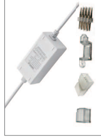
LED RGB Soft Strip HV Accessory package