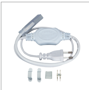
LED Strip 2835 Accessory package